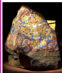
Harald Bluetooth's rune stone in Jelling, Denmark, depicting Jesus Christ.

The Bluetooth logo with runes H and B, referring to Harald Bluetooth.