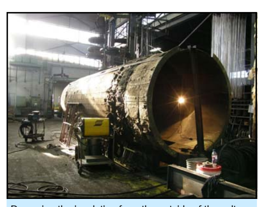
Removing the insulation from the outside of the salt tank.