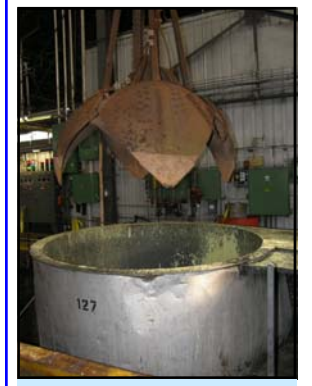
Cleaning out the bottom of the tank.

While down we also fabricated and attached another quench duct that, once complete, will be home to a second agitator as well as a cooling system. This additional agitator will further improve the quality of work produced, and the cooling system will help keep us in production when the schedule is full.