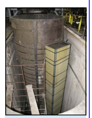
Replacing the tank.