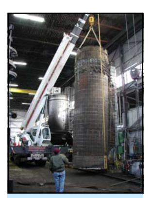
Removing the salt tank.