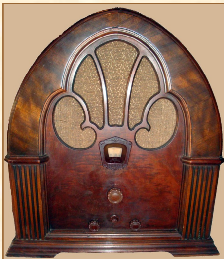
Philco Model 90—circa 1931

In 1991 a small group of radio enthusiasts from the Philadelphia area formed the Delaware Valley Historic Radio Club. These folks all shared a common interest in collecting and preserving antique radios, televisions, and related vintage electronics.