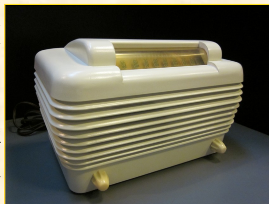
Philco Model 620—circa 1935