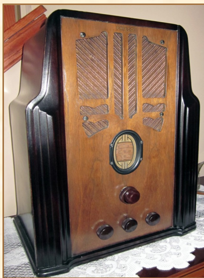
Stromberg Carlson Model 1101— circa 1946

decades such as the 1920s, 1930s or 1940s. Some specialize in antique televisions or vintage electronics. Whatever the favorite, the goal is to try to restore the equipment to its original glory while maintaining the original look and feel.