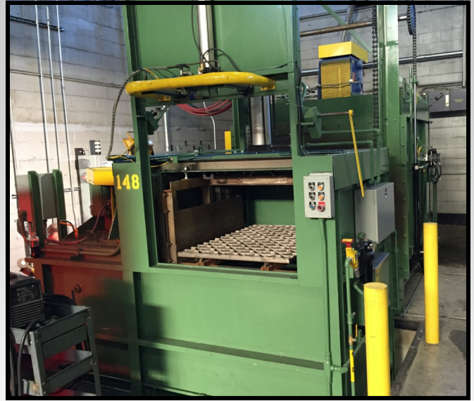
The new 140 Furnace at Rex Heat Treat Lansdale.

One of the things that makes our operation unique in the heat treating industry is our capability to meet the processing demands for Solution Treating special materials. Most specifications for Solution Treating the titanium alloy 6AL-4V, for example, require this material to be quenched rapidly. In some cases this “quench delay” is as short as four seconds. With our unique vertical Gantry design, we have been able to meet these specifications for years and it has been a huge value to us as we compete for business in the Aerospace and Medical markets. As we continue to grow our business in these areas, we have made a move to offer even more.