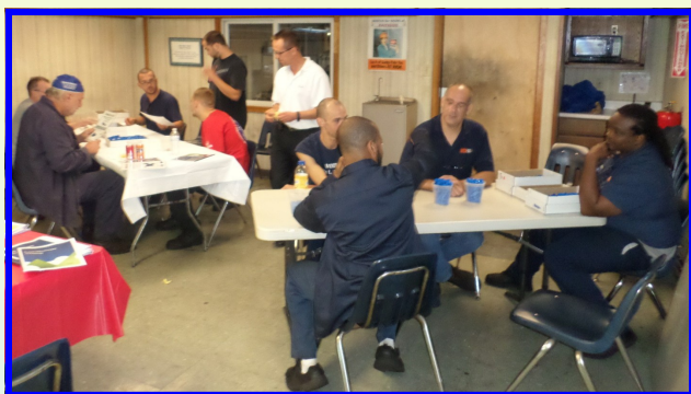
The employee lunchroom was turned into a work room during the Lean Overview Training. Employees from various departments and shifts worked together to problem solve.