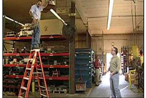
Very unsafe way to use a ladder.

Basically, most of us are just thinking about getting the job done and we tend to rationalize the risk of getting injured. We think to ourselves that we have done this job many, many times this way and nothing bad has happened. Therefore, nothing bad will happen to us today. On an intellectual level, we realize there is a potential danger but decide that the risk of being injured is low. Because we have not been injured so far, we actually think of ourselves as being very safety conscious. We know the right way