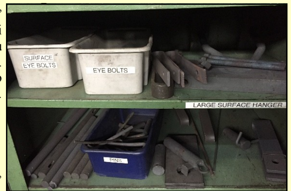
Here is an example of Straighten in a 300 line storage cabinet where a permanent location has been identified for some parts then labeled.