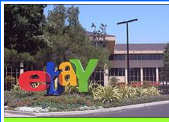
eBay headquarters in San Jose.

The online auction website eBay was founded as AuctionWeb in San Jose, California, on September 3, 1995, by French-born Iranian computer programmer Pierre Omidyar as part of a larger personal site that included, among other things, Omidyar's own tongue-in-cheek tribute to the Ebola virus. The very first item sold on eBay was a broken laser pointer for $14.83. The company officially changed the name of its service from AuctionWeb to eBay in September 1997. Originally, the site belonged to Echo Bay Technology Group, Omidyar's consulting firm. Omidyar had tried to register the domain name echobay.com, but found it already taken by the Echo Bay Mines, a gold mining company, so he shortened it to his second choice, eBay.com.