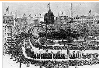
Labor Day Parade, Union Square, New York, 1882

Through the years the nation gave increasing emphasis to Labor Day. One by one, the states passed legislation to create a Labor Day holiday. And on June 28, 1894, Congress passed an act making the first Monday in September of each year a legal holiday.